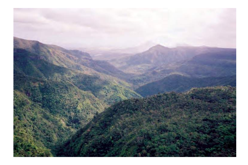
Photograph B for Question 4